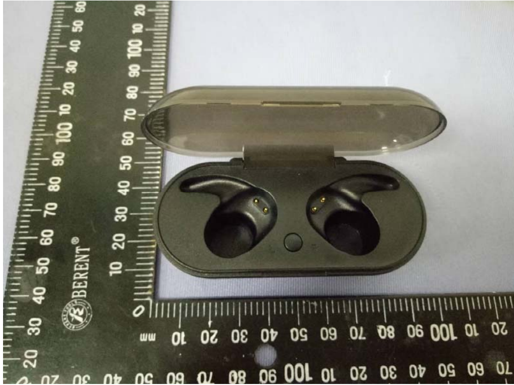
Figure 3 Overall view III of Charge Case (充电盒III)