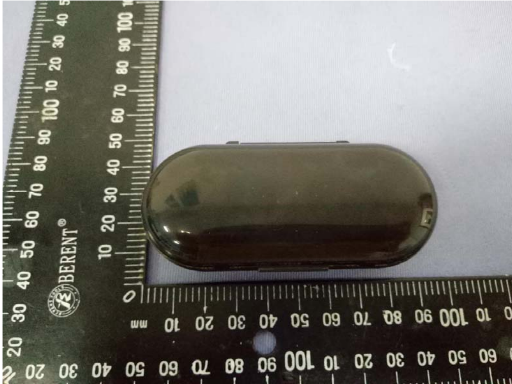
Figure 1 Overall view I of Charge Case (电池图I)