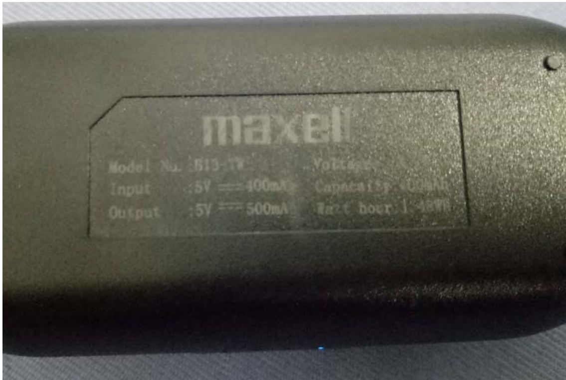
Figure 5 Charge Case label (充电盒标签)