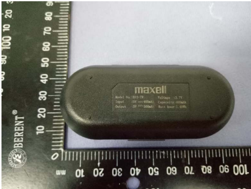
Figure 2 Overall view II of Charge Case (充电盒II)